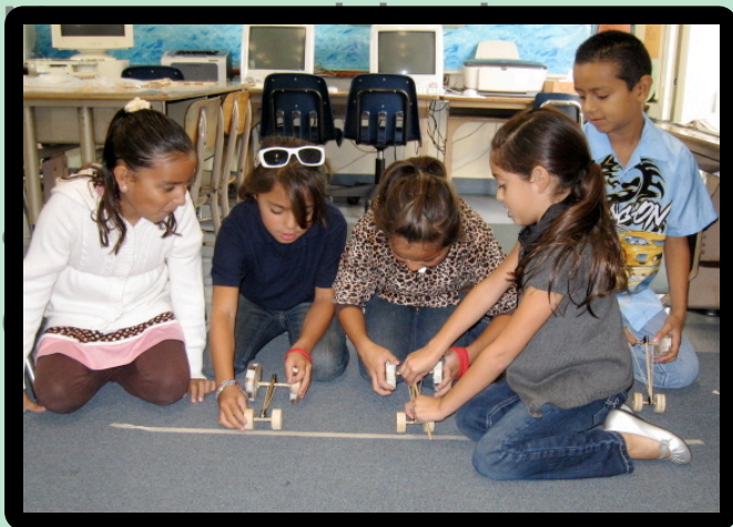
GATE students get ready to race the cars they built in the Learning Lab.

We are only a few weeks away from moving into our new front offices. Our new entrance will have much more room and a larger waiting area. We appreciate your patience in this long process! Dominguez family, be sure to give a big "Thank you" to the construction team when you see them.